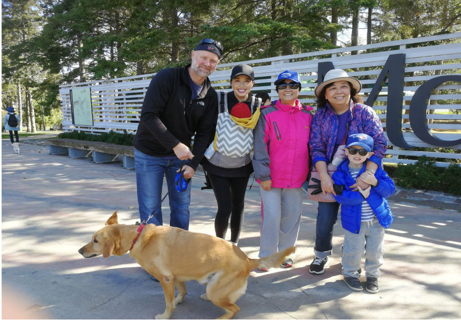
Didn't they realize that the dog couldn't wait any longer to poo?